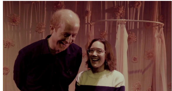
BOW Testimonials, 1min